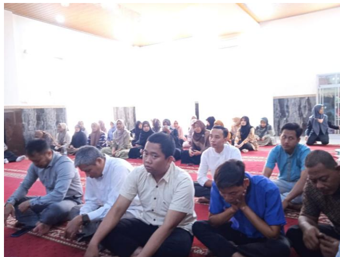
Figure 1. Communication Psychology Counseling

This Community Service activity has been carried out according to the stage planned from the beginning. This activity was carried out with the community, and the team.